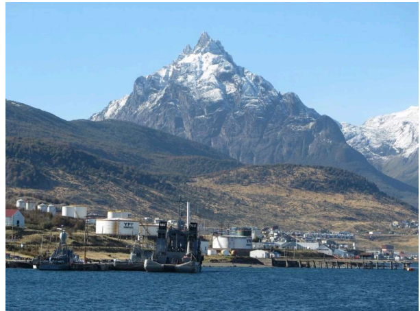
End of the World signboard at Ushuaia / Mount Oliva dominating Ushuaia

Day 10 El Chalten 2 Mar SUN We fly from Ushuaia with Aerolineas Argentinas AR1897 3:35PM, arriving El Calafate airport 4:55PM (Flight timings changed 1/1/2025). We use chartered transport to travel north to El Chalten 200km 3hr. Rest of stay free to relax and enjoy the views of Mount Fitz Roy jagged peaks. O/N El Chalten.