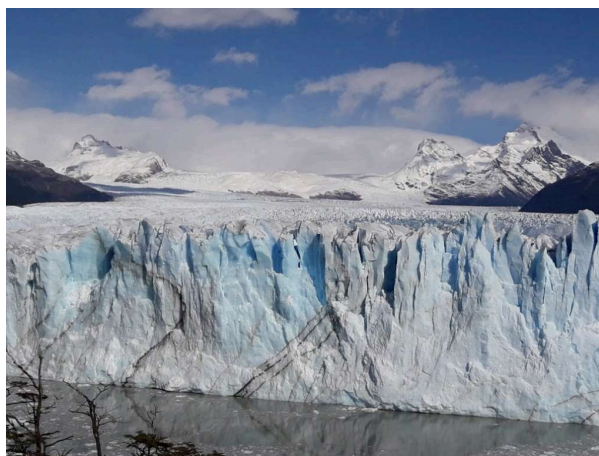
Mountainscape at El Chaltén / Perito Moreno Glacier width 5km length 30km

Day 13 Puerto Natales (Chile) 5 Mar We take the morning public bus 6hr to Puerto Natales crossing into Chile Patagonia. Immigration is strict here, so NO fresh items inside baggages. It is the gateway to Torres del Paine National Park. Free rest of day to wander this small pretty town overlooking the Señoret Channel. This small town was founded back in 1911 for sheep ranching. O/N Puerto Natales Chile.