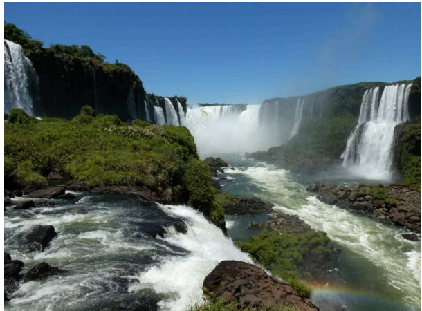
Iguazu Falls Argentina / Iguacu Falls Brazil side

This will be a small group backpack trip using 6 domestic flights, local buses and airport taxis . We stay in decent clean guesthouses, apartments and budget hotels ranging from 2 to 5 pax sharing units . It is essential that members