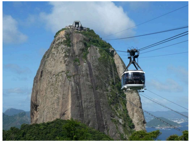
Selaron Steps / Sugarloaf or Pao de Acucar

Day 4 Fly Fox Iguacu Brazil and Puerto Iguazu 24 Feb Early morning flight GOL Airlines G3 9006 07:45am, arriving 10:00am (Updated 26 Jan 2025) 2hr to Brazil's Fox Iguacu Airport. We transfer by chartered transport 15min to nearby Brazil Iguacu National Park. There are baggage lockers at the entrance for our big luggage. We also visit the nearby Parque das Aves Bird Park, home to many colourful birds which includes a humming bird aviary. By late afternoon, we cross border into Argentina by chartered transport for our overnight stay in Puerto Iguazu. O/N Puerta Iguazu (Iguacu Park Entrance BRL100, Bird Park entrance revised BRL80, baggage lockers and transfers is covered) . Option for members to take the Gran Aventura 2hr boat ride where one is guaranteed to get wet. Dec 2024 price is USD120